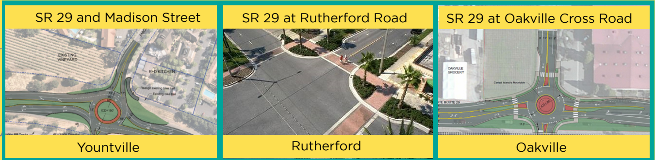
Renderings of Project Options