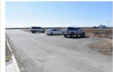
1 Cullinan Ranch • Amenities include: kayak and boat launch, observation area, and interpretive panels • Enhance Parking Lot & Portable Restroom