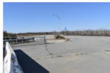
2 Guadacanal Village • Enhance observation area, parking lot, and interpretive panels • Improve bike/ped trail • Non-ADA compliant pedestrian stairs